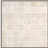
Travertine Mosaic 48x48