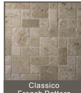
Classico French Pattern