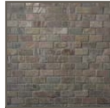
Copper Quartzite brick bond 25x50