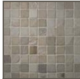
Desert Plains 50x50